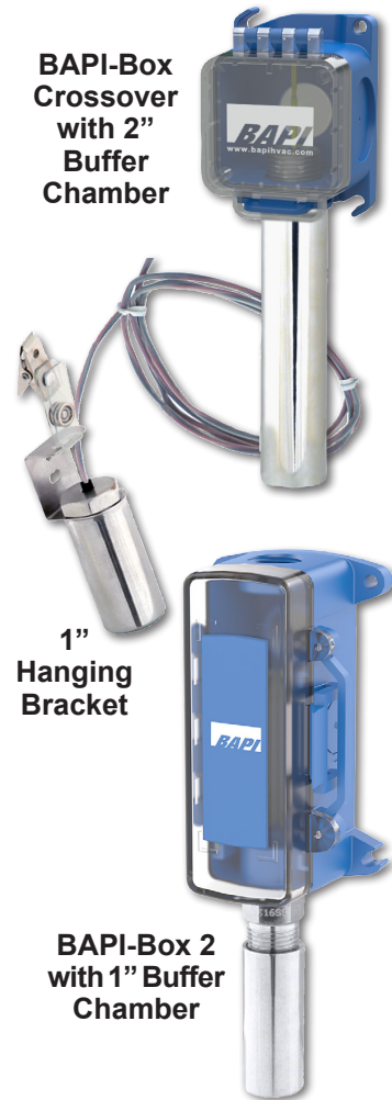
BAPI-Box Crossover with 2" Buffer Chamber