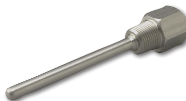
Two Part (welded) Thermowell