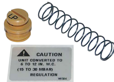
Regulator Conversion Kit, Natural Gas to LP