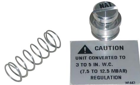
Regulator Conversion Kit, LP to Natural Gas