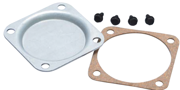
Non-Regulating Conversion Kit