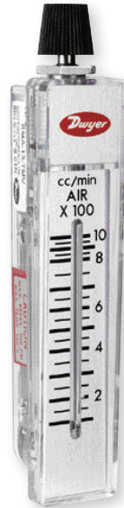
Model RMA-TMV 2" scale, 4-13/16" high