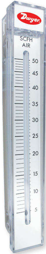
Model RMC 10" scale, 15-3/8" high