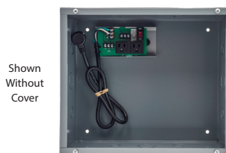
Shown Without Cover