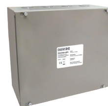
Shown With Cover