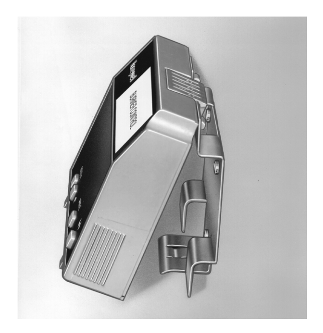
Fig. 2. Mounting the Keyboard Display Module on the Remote Mounting Bracket.