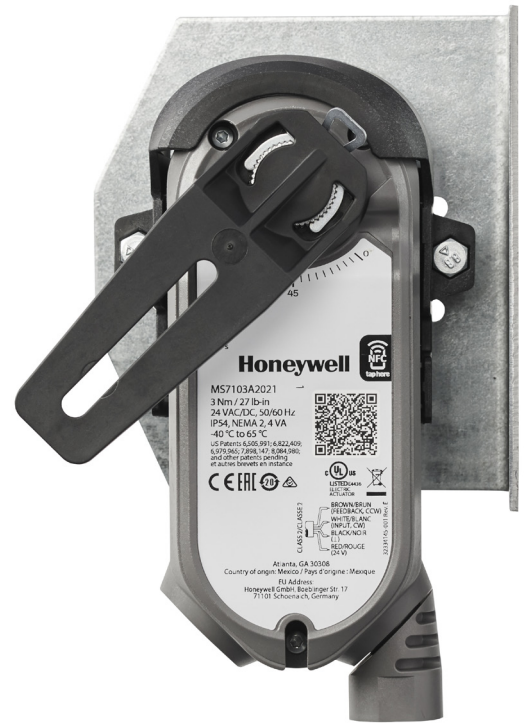
Diamond Actuator Crank Arm Kit With Foot Mount

*Note: Includes Crank arm, angle bracket, and 2 ball joints (installer must supply linkage rod)