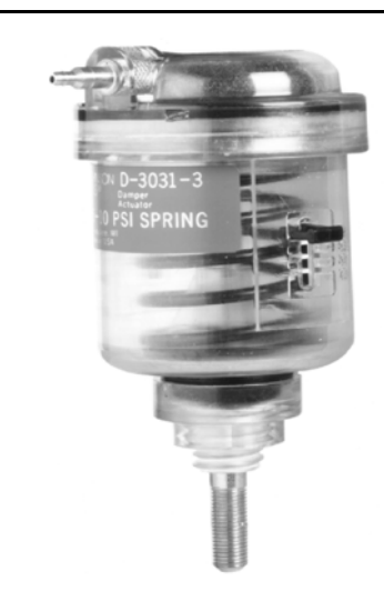
D-3031 Pneumatic Piston Damper Actuator

If the D-3031 Pneumatic Actuator fails to operate within its specifications, replace the unit. For a replacement actuator, contact the nearest Johnson Controls® representative.