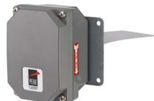
F262 Airflow Control