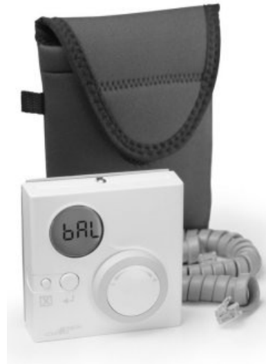
Figure 1: Handheld VAV Box Balancing Tool

If the product fails to operate within its specifications, replace the product. For a replacement product, contact the nearest Johnson Controls® representative.