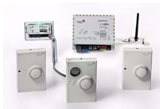
FX-ZFR1811 Routers (Top Left), FX-ZFR1810 Coordinator (Top Center), and FX-WRZ Series Sensors (Bottom)