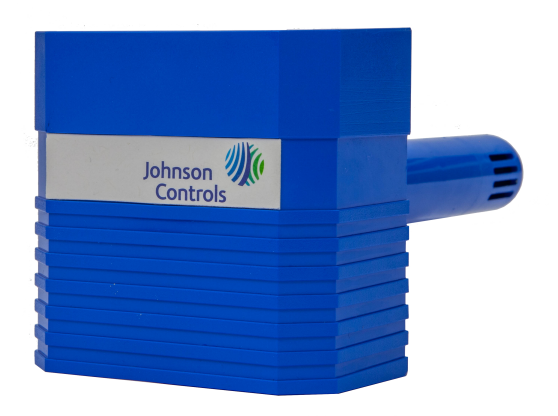
Figure 1: HE-69xx Series Duct Probe Humidity and Temperature Sensor