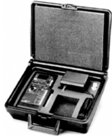
M9000-200 Commissioning Tool