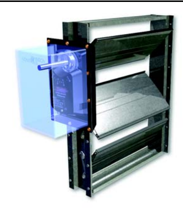
M9000-300 Shown Mounted on a Control Damper