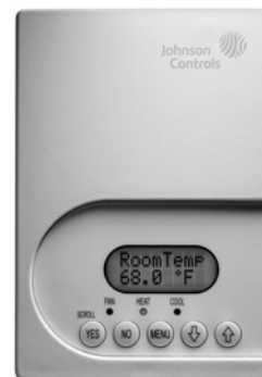
TEC2647Z-2+PIR Zone Controller (Left) and TEC2664Z-2 Rooftop Controller (Right) for Stand-Alone and BACnet MS/TP Networked Applications

Refer to the TEC Zoning Control System for Stand-Alone and BACnet® MS/TP Networked Applications Product Bulletin (LIT-12011397) for important product application information.