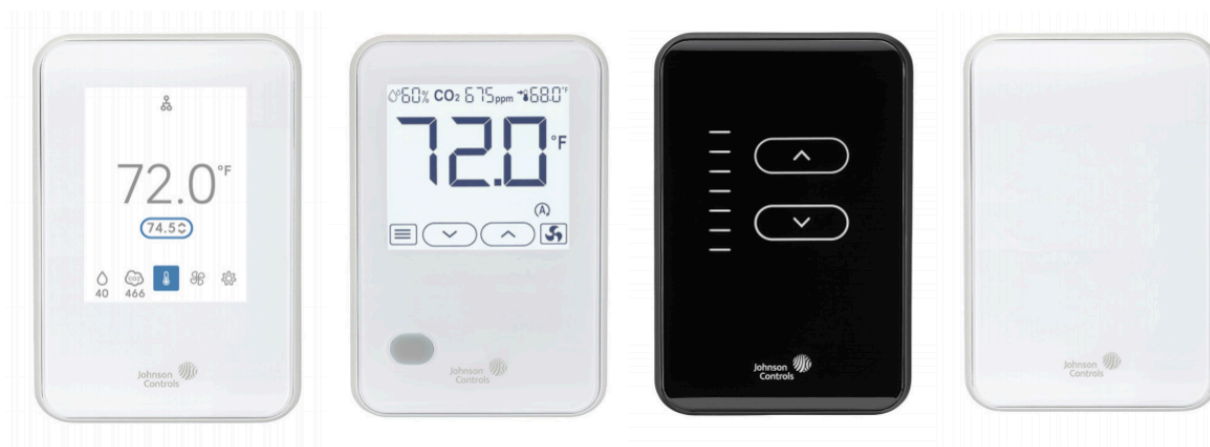
Figure 1: NS8000 Series Network Sensor models

The NS Series Network Sensors function directly with Metasys® system Field Equipment Controllers (FECs), Metasys Network and Control Engines (NCEs), Advanced Application Field Equipment Controller (FACs), Metasys VAV Box Equipment Controllers (CVM) and General Purpose Application Controllers (CGM), VAV Modular Assembly (VMA16) Controllers, and Facility Explorer™ FX-PC Series Programmable Controllers (FX-PCGs, FX-PCVs, and FX-PCXs). The sensors are also compatible with Verasys® and Johnson Controls® Smart Equipment.