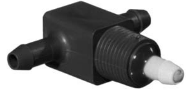
R-3712 Diode Restrictor Tee