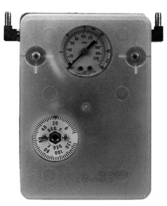
T-8000 Bulb Element Controller

If the T-8000 Bulb Element Controller fails to operate within its specifications, replace the unit. For a replacement thermostat, contact the nearest Johnson Controls® representative.