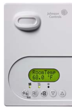
TEC26x6H-4+PIR Series Thermostat Controller