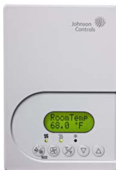
TEC26x6(H)-4 Series Thermostat Controller

Refer to the TEC26x6(H)-4 and TEC26x6H-4+PIR Series BACnet MS/TP Networked Thermostat Controllers with Dehumidification Capability, Fan Control, and Occupancy Sensing Capability Product Bulletin (LIT-12011587) for important product application information.