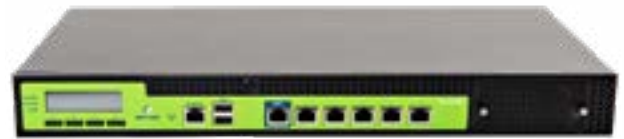
ONS-NC600 Network Controller