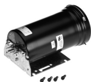
331-2929 No. 4 Pneumatic Actuator for frame mounting.