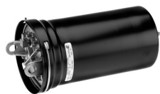
331-2904 No. 4 Pneumatic Actuator with pivot mounting bracket.