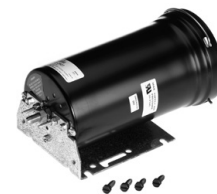
331-2974 No. 4 Pneumatic Actuator with non-pivot bracket for unit ventilator.