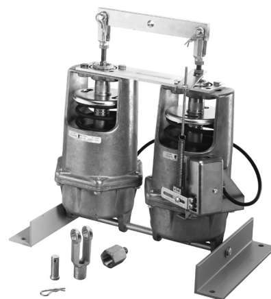
331 No. 6 Pneumatic Damper Actuator— Tandem Mounting.