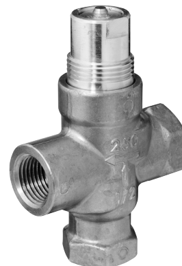
Powermite MZ Series Three-way Globe Valve.