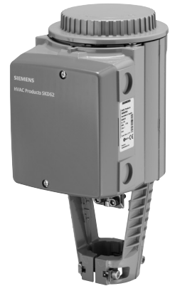
Flowrite SKD Valve Actuator.