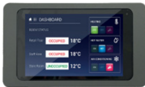
7" Android™ Touch Screen Display

Requires Onyx LX USB to RS-485 adapter to program with Onyx LX UI