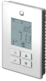
Onyx® BW437-FCU-LX & Onyx® BW437-RTU-LX

These compact, BACnet® MS/TP thermostats include programs for most FCU, RTU, HP, and AHU applications. Configuration is made simple using the menu-driven keypad, or a BACnet monitor, like the freeware Onyx® LX UI (requires a separate special USB adapter), or even a Niagara host.