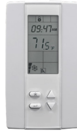
Onyx® TZ100-LX & Onyx® TZ200-LX

Requires Onyx LX USB to RS-485 adapter to program with Onyx LX UI