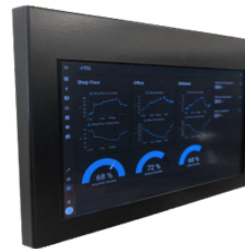
10" Android™ Touch Screen Display

Designed for optimal performance, the Lynxpring TSD 7 utilizes an advanced processor to integrate a powerful graphics engine that displays most any webpage, including advanced HTML5 visualization pages. It is ideal for managing operating parameters of systems, such as monitoring, obtaining values, equipment, and system status, and viewing alarms.